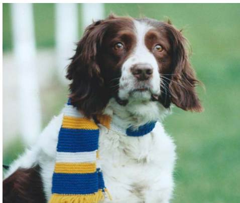
Ben The Dog as he was colloquially known wearing his Felixstowe Port & Town scarf circa 1997/99 and the actual poster the Green distributed to their Saturday night outlets.

Ok I've taken a bit of literary licence, it wasn't one man and his dog, it was one man, his wife and their dog.